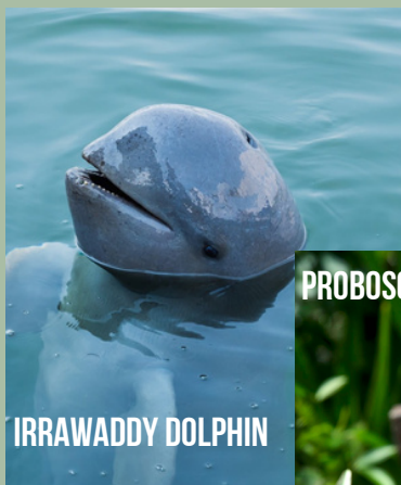
Below Image Source: https://www.nationalgeographic.com/animals/mammals/facts/proboscis-monkey Photographer: Joel Sartore

We must protect RBP and the local people by stopping the developers.